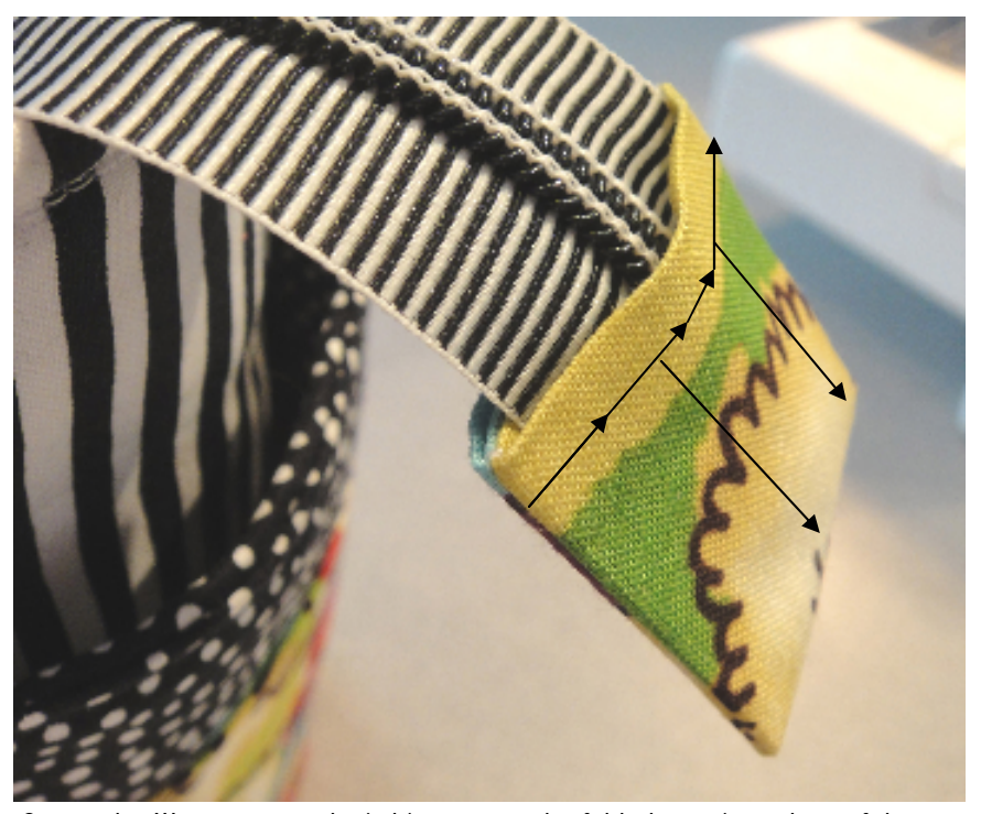
Step 55b—We recommend stitching across the folded opening edges of the Zipper Tab (see step 56a, for the exception of plastic zipper teeth), and also alongside the enclosed zipper teeth, to secure it. (stitching lines are indicated by arrows)