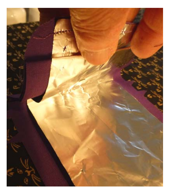
Now continue your folding (step 5), keeping your foil pushed up into the fold as far as possible, and being sure your foil remains centered and smooth on the WS of your Card Cozy.