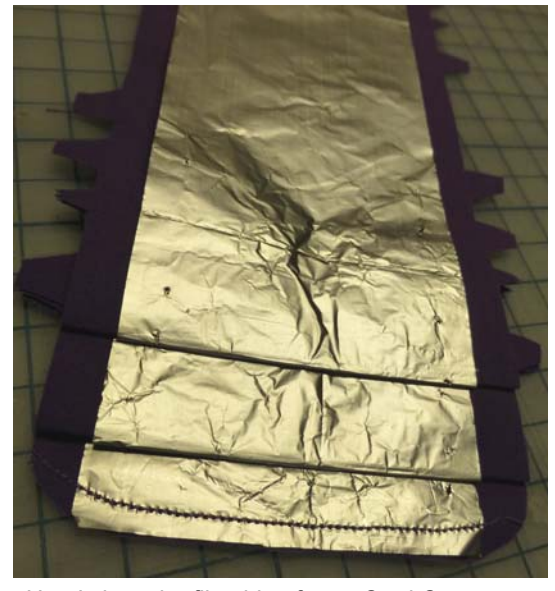
Here's how the flip-side of your Card Cozy looks after step 6.

This is getting a little easier now, right? :) So keep following steps thru step 10.