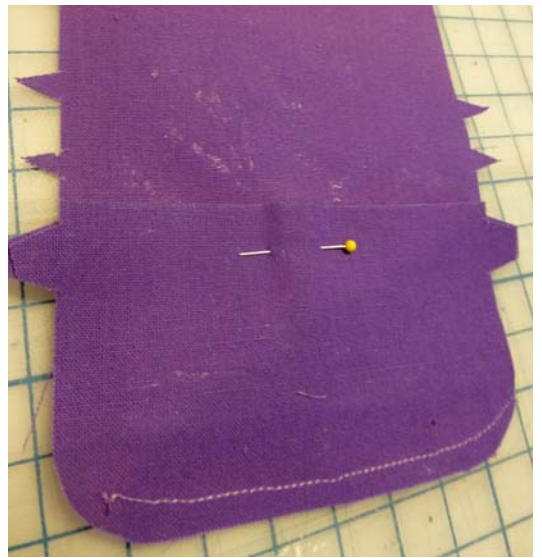
Once you've aligned your "A" notches with the "B" notches (step 4), place a pin (thru ALL layers) to secure this fabric placement.