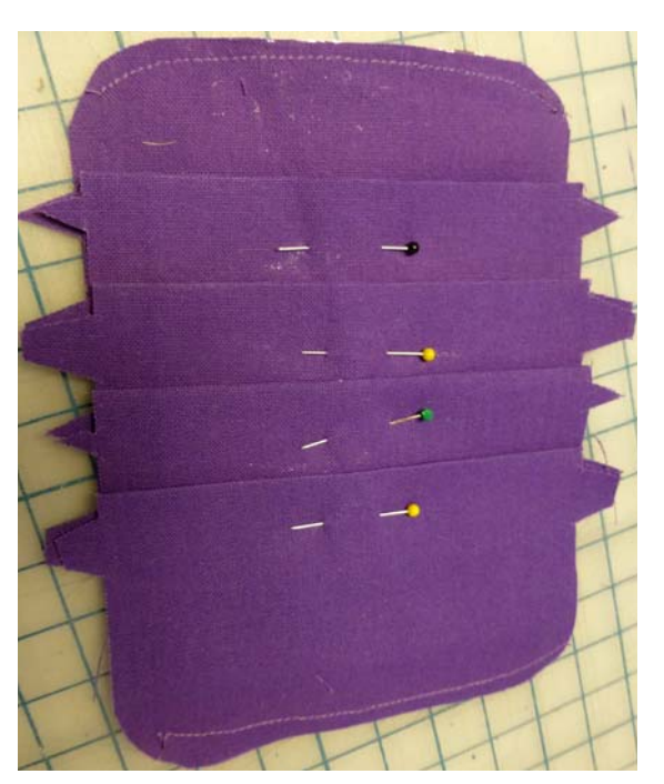
This is how your small Card Cozy looks when it all fold up. (after step 10).

This is getting a little easier now, right? :) So keep following steps thru step 10.