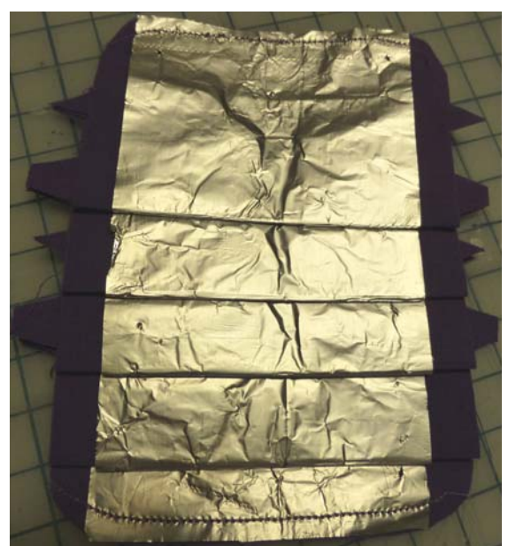
And here's how the flip-side of the small Card Cozy should look as you move on to step 11.

If you're making a large Card Cozy, you'll obviously continue folding until you've created 2 more card slots.